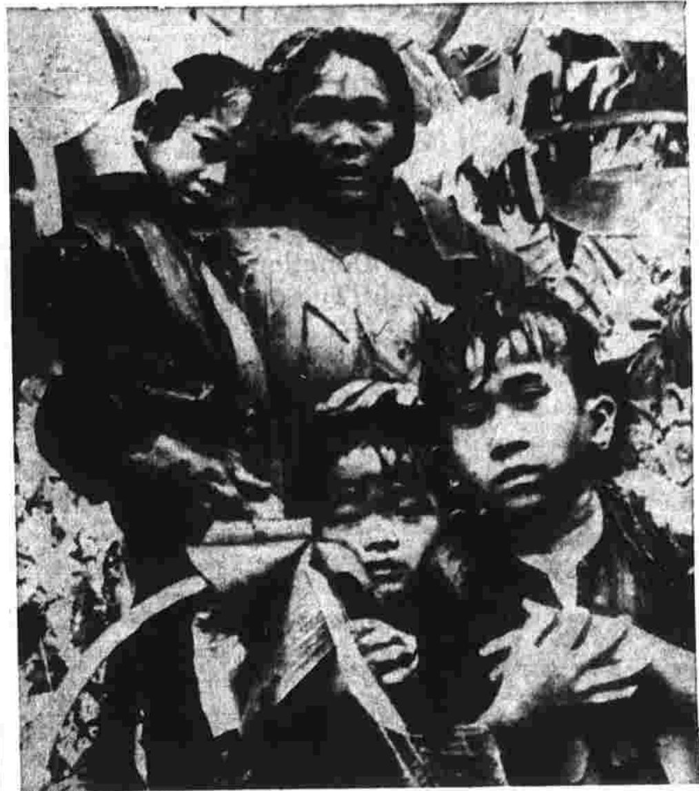
Caught up in the swirl of a war they don't understand, this Vietnamese family, water-drenched and cold, is shown after emerging from a Viet Cong guerrilla hideout. This time they survived!