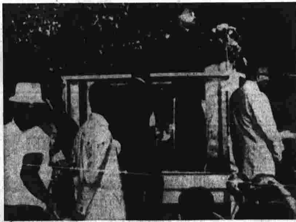
Guards surround Dr. Martin Luther King during his talk yesterday in Winnetka, a suburb of Chicago. A crowd of 8,000 turned out for his second day of speeches.

New England government threatening to take away cigarettes and matches from some convicts in attempt to check spreading arson and rioting in nation's prisons.